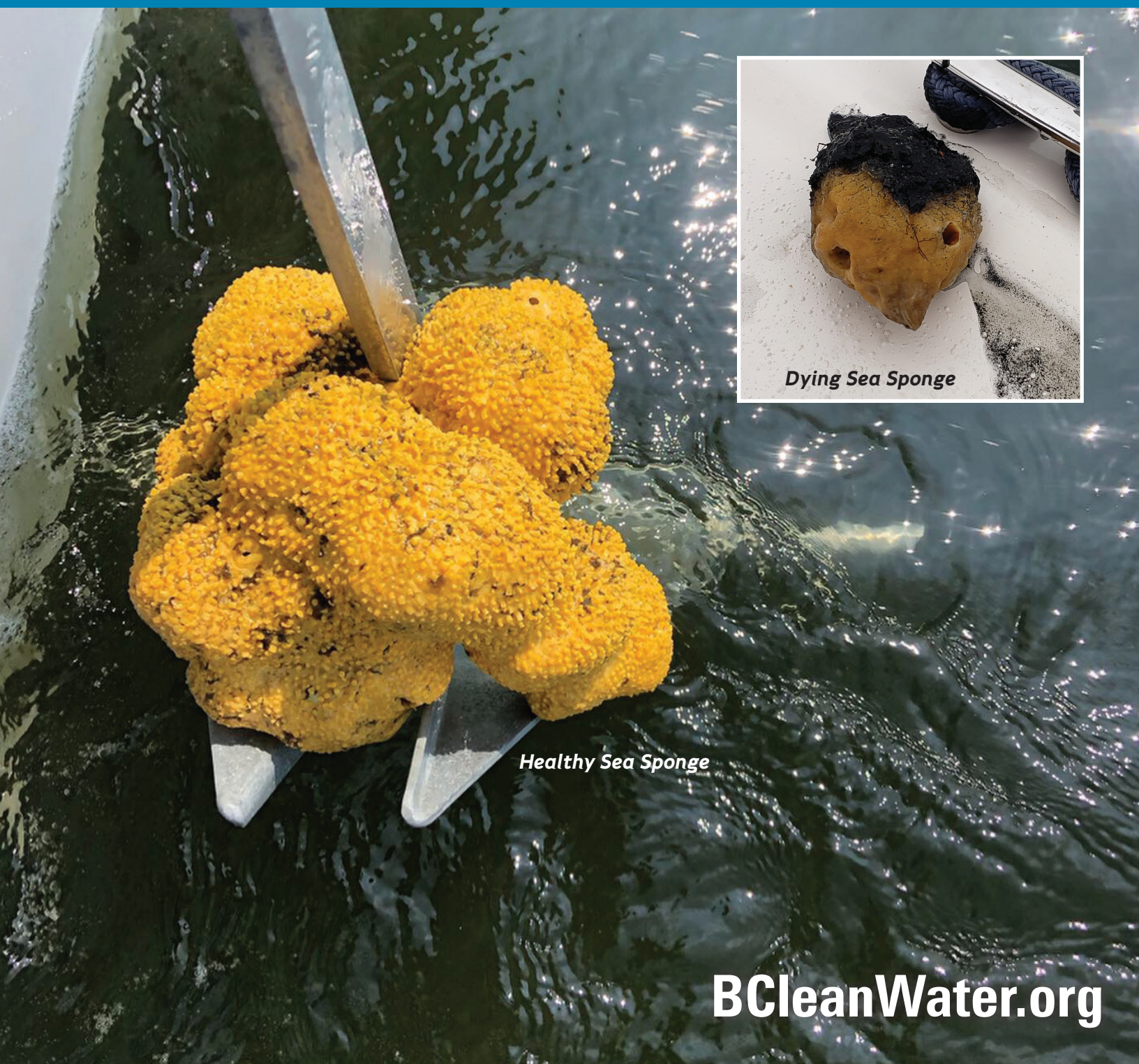
Healthy Sea Sponge