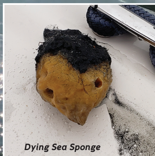
Dying Sea Sponge