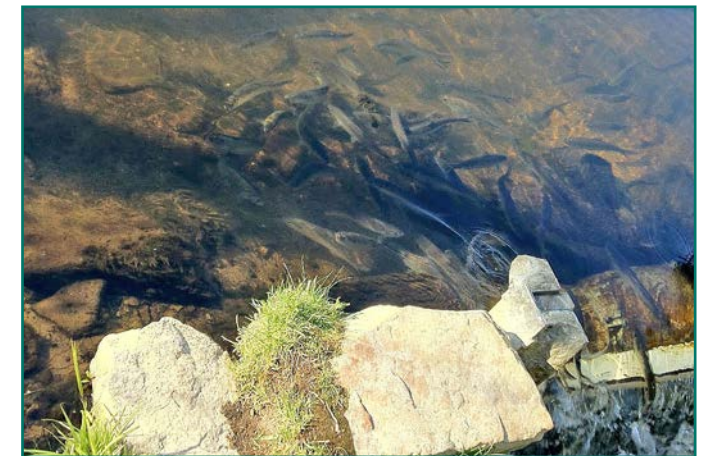
WELCOME, ALEWIVES AND BLUEBACKS!

Once the fish start coming, volunteers don’t distinguish between the two varieties. “You can’t tell the difference unless they are out of the water on their sides,” Amy explained, “so we refer to river herring collectively.”