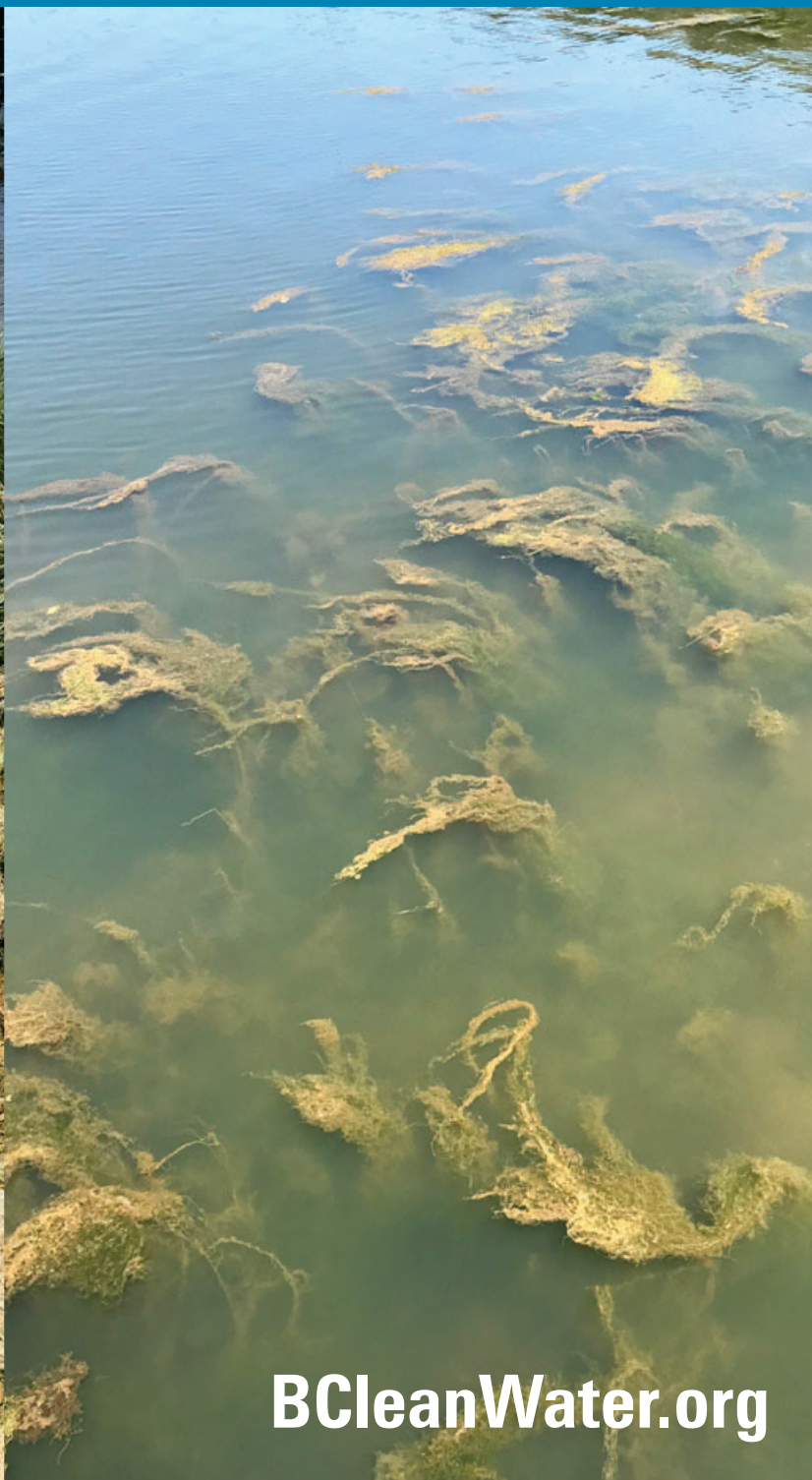
Ulva lactuca outbreak, Prince Cove and Warren's Cove, June 2018.